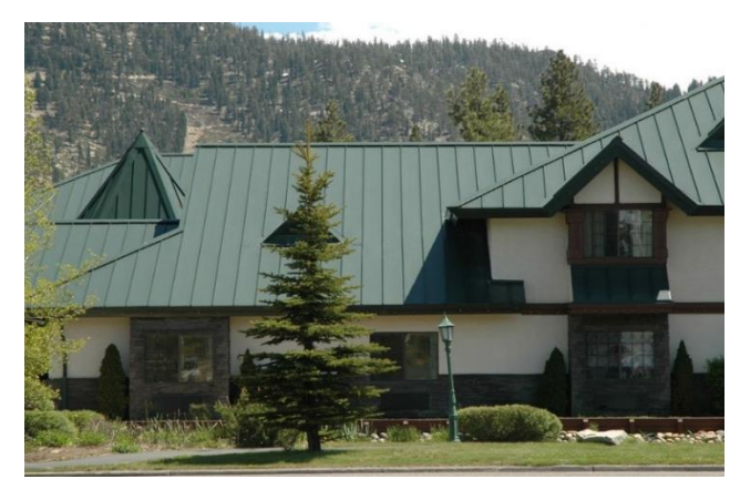
(Above and Right) The only difference is an hour in time and the changing the angle of the sun

Oil Canning can be defined as visible waviness in the flat areas of metal roofing and metal wall panels. In technical terms, oil canning is referred to as elastic buckling (more commonly known as "stress wrinkling"). Oil canning can occur in any type of metal panels: steel, aluminum, zinc, or copper. For purposes here, all four terms shall be considered synonymous: Waviness, elastic buckling, stress wrinkling and oil canning. The degree of waviness can be difficult to measure, but may be visually apparent, especially under specific lighting conditions.