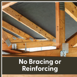
No Bracing or Reinforcing