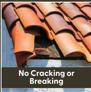
No Cracking or Breaking